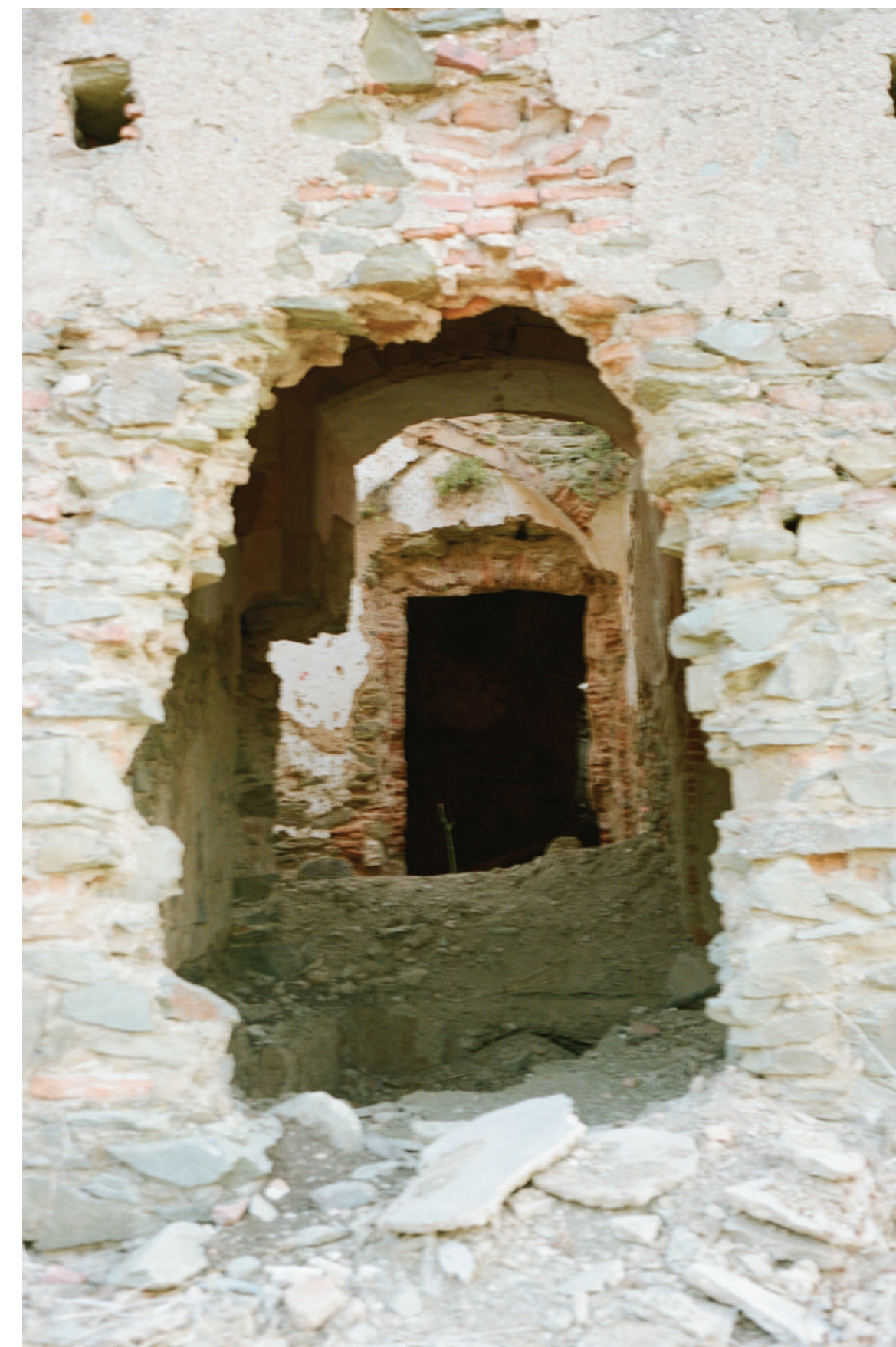
2/10_ Untitled (Ruínas do Convento de São Francisco) inject print, 20.5x26.5 cm