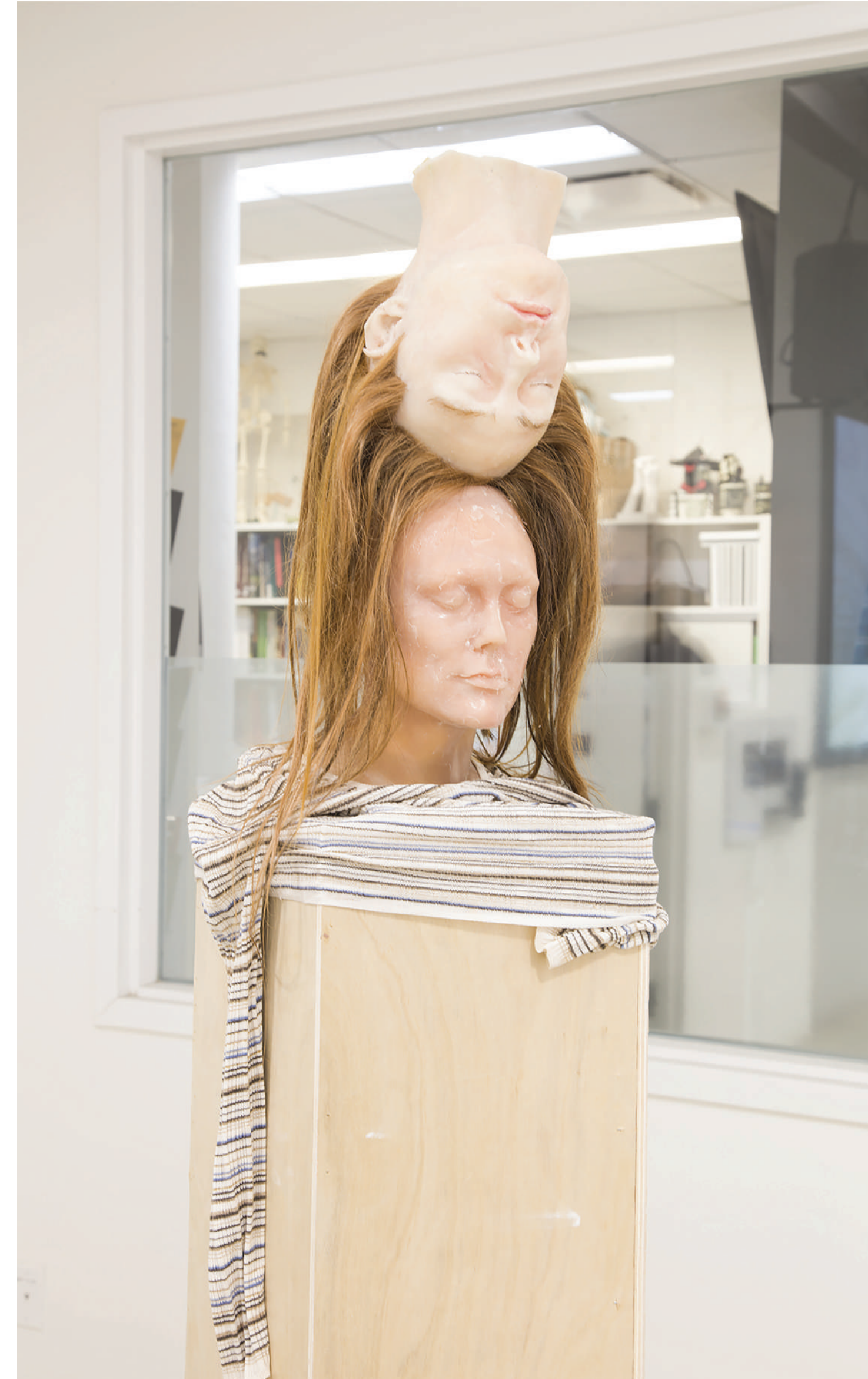
8/10_ Performance of Failure (Heads), 2019 200x40x40 cm Silicone, wood, hair, shirt

Performance of Failure is a series of sculptures reflecting and speculating about invisibility, futility, alienation and one's relationship to its own materialistic merit.