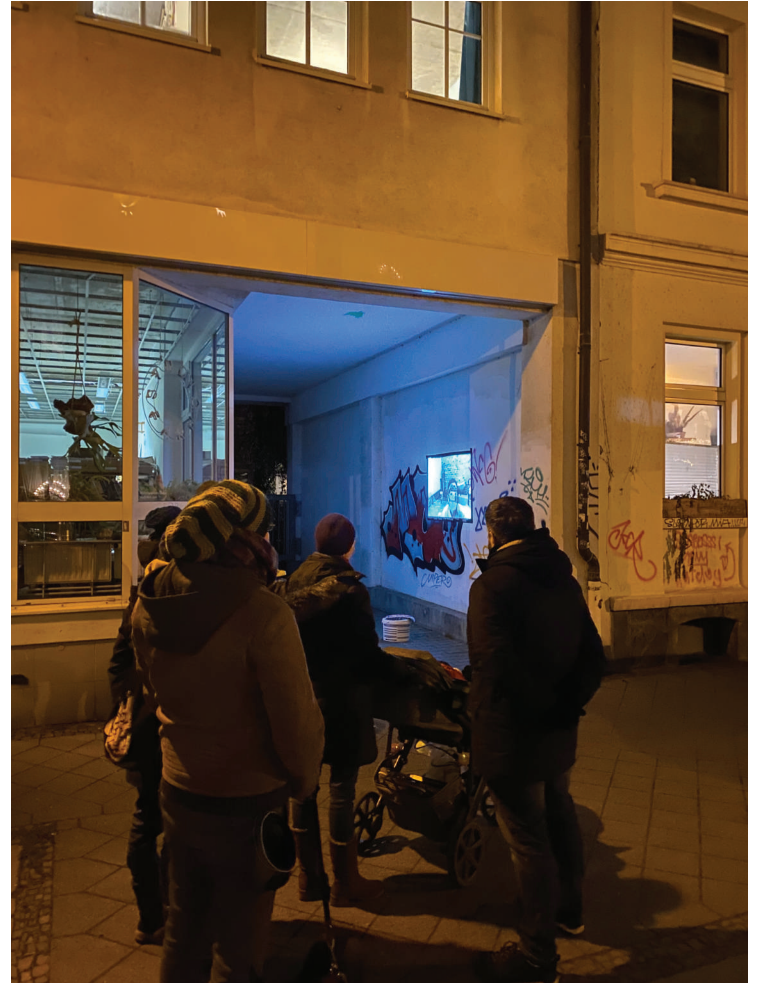
7/10 How Not To Be Seen (and Seen Again) installation view from Lichtspiele Festival 2021, Leipzig