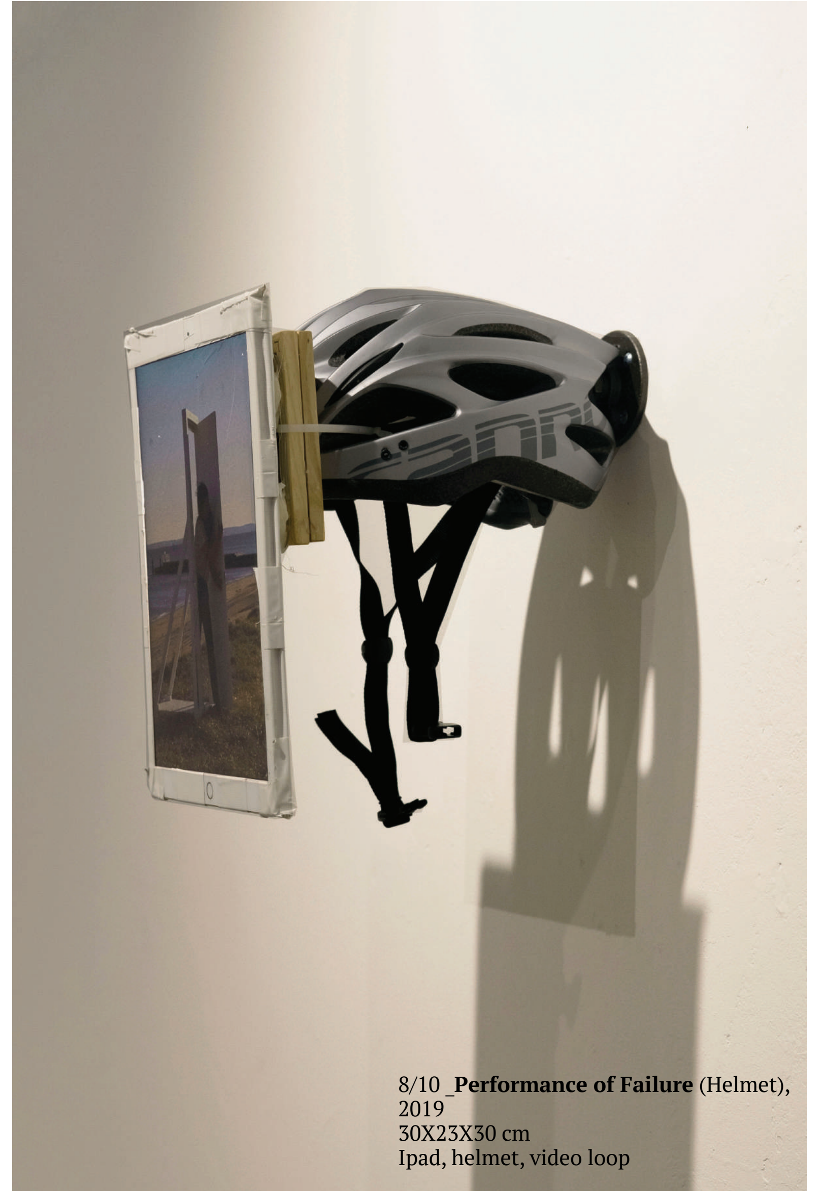
8/10_ Performance of Failure (Helmet), 2019 30X23X30 cm Ipad, helmet, video loop