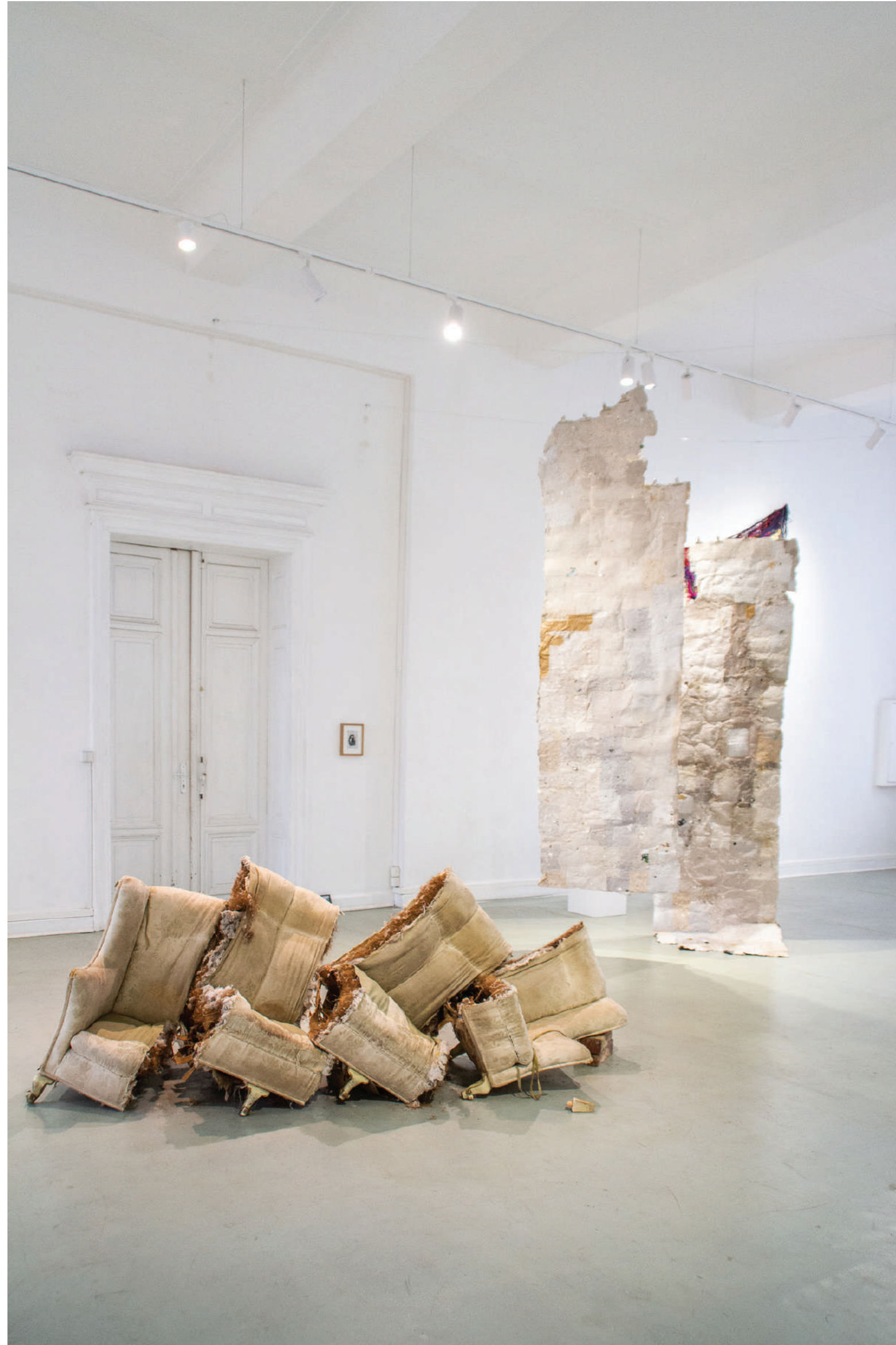
2/10_ Untitled (paper blanket) recycled trash, hummus peels, Elad's curls 350 cmx 90 / 360cmx 90, 2021