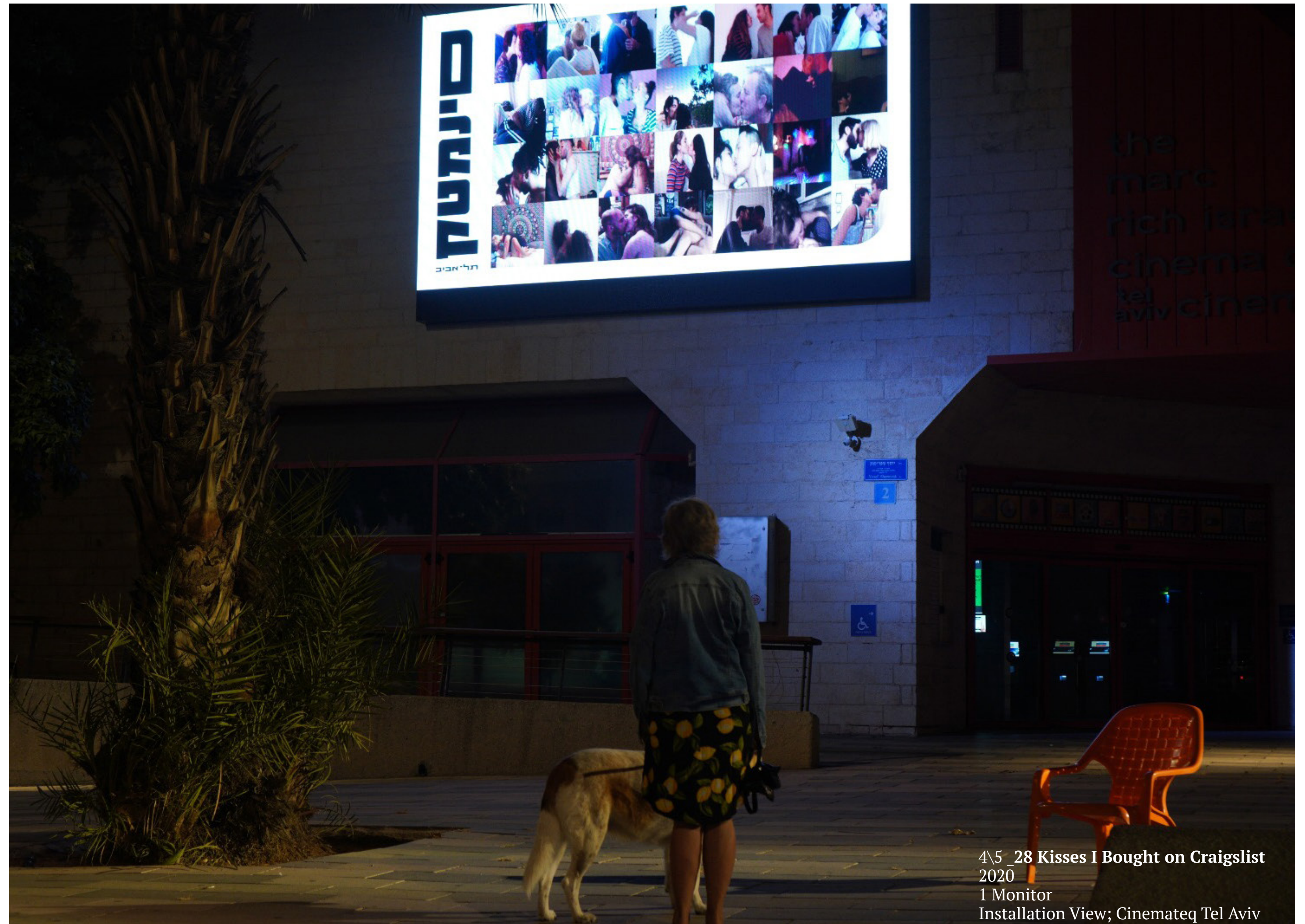
4\5_28 Kisses I Bought on Craigslist 2020 1 Monitor Installation View; Cinemateq Tel Aviv

The portrait, eventually uncovered many facets of our reality: some that were introduced by the pandemic, and others that have always been there.