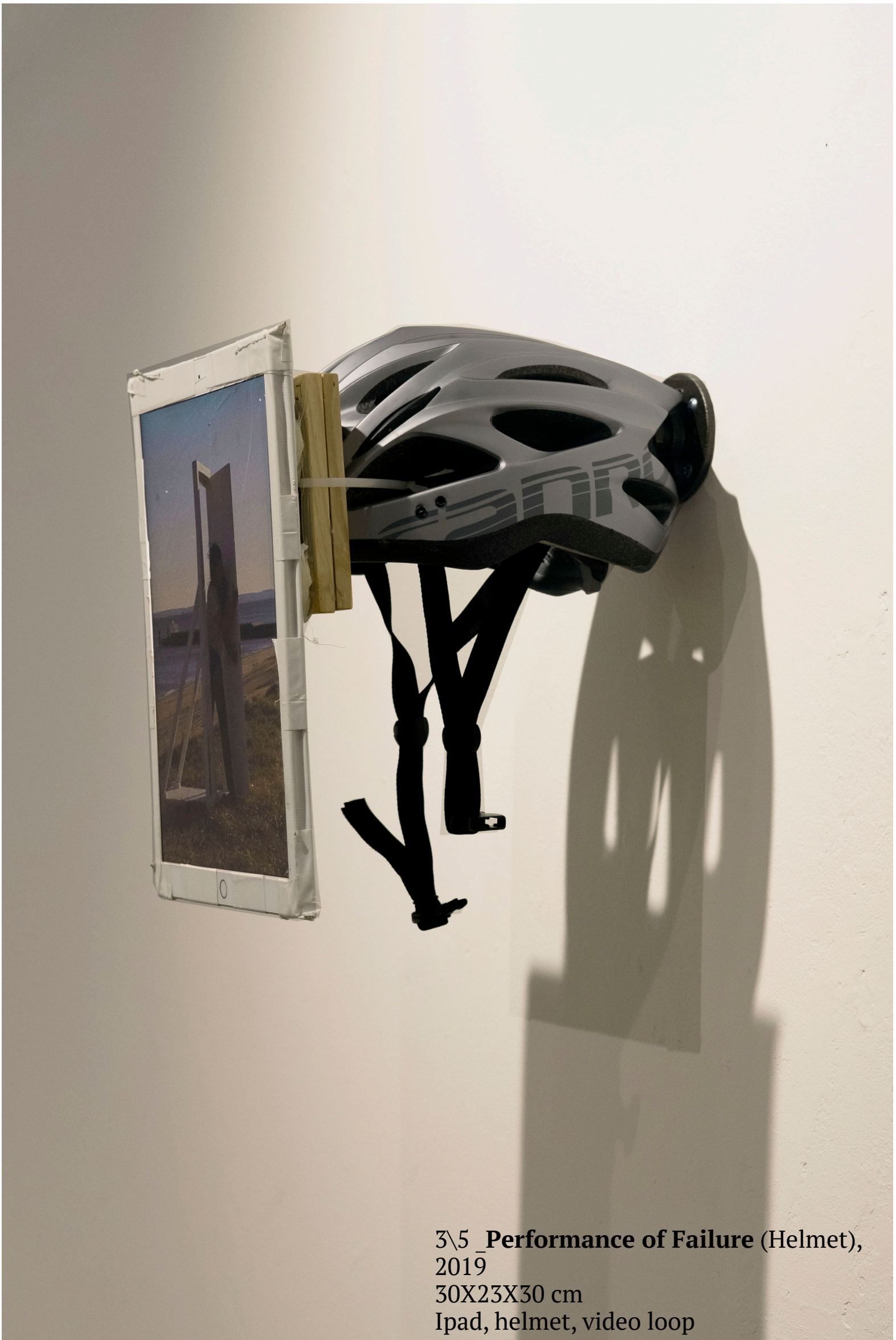
3\5 Performance of Failure (Helmet), 2019 30X23X30 cm Ipad, helmet, video loop