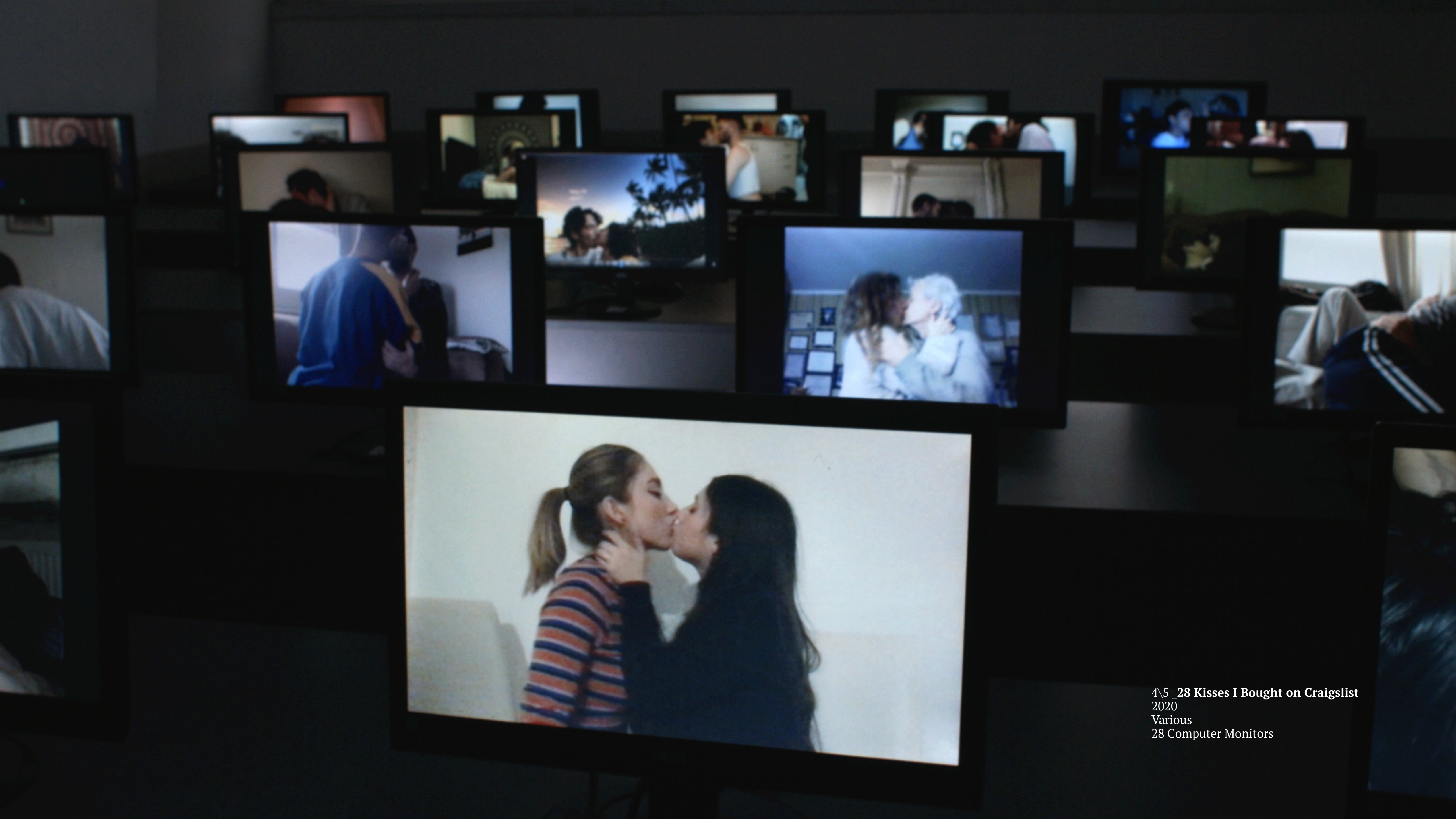
4\5_28 Kisses I Bought on Craigslist 2020 Various 28 Computer Monitors