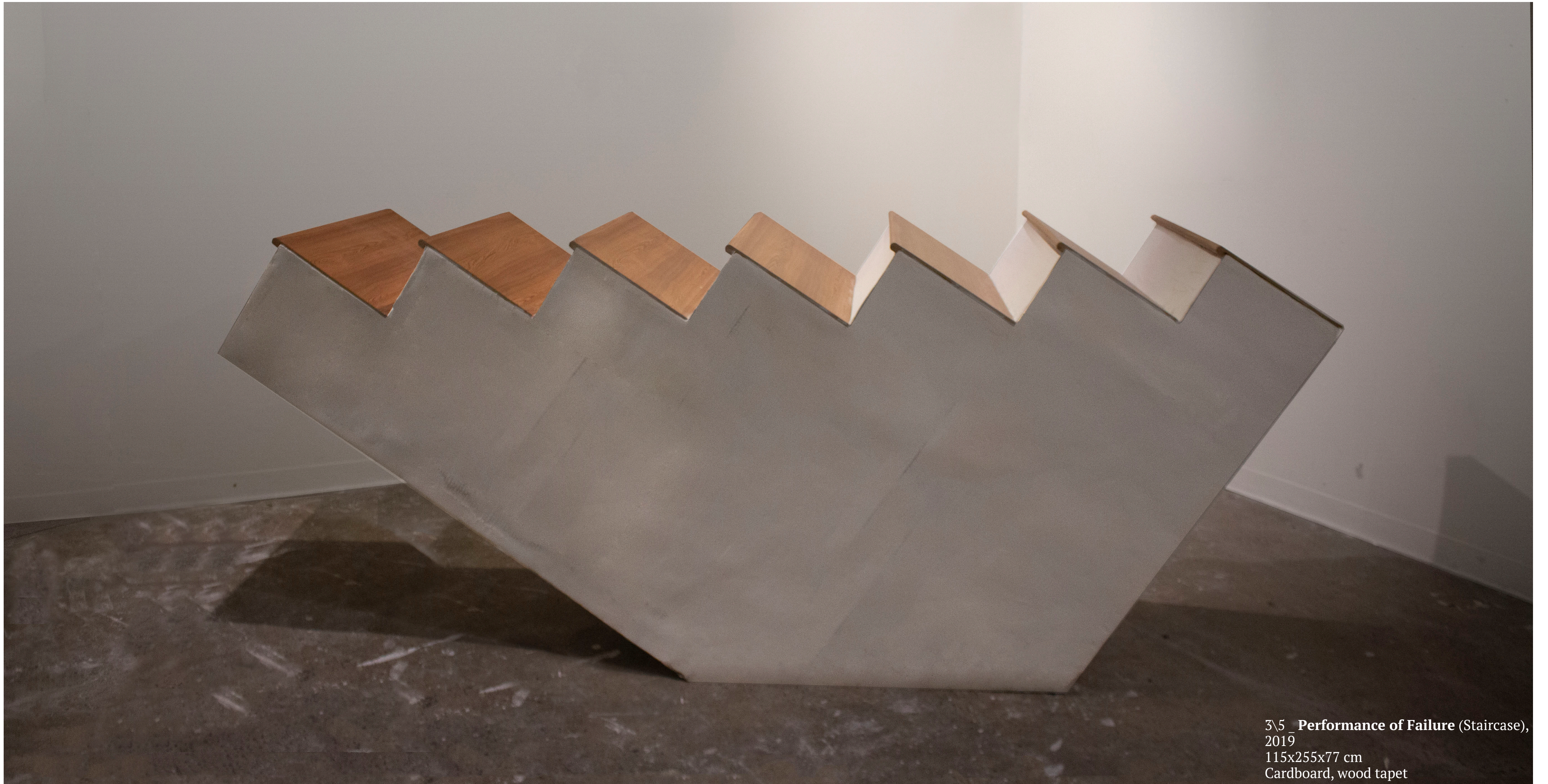
3\5 Performance of Failure (Staircase), 2019 115x255x77 cm Cardboard, wood tapet